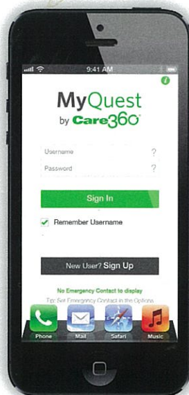
MyQuest Mobile Health App

Vital information and insights about patient health — right at their fingertips.